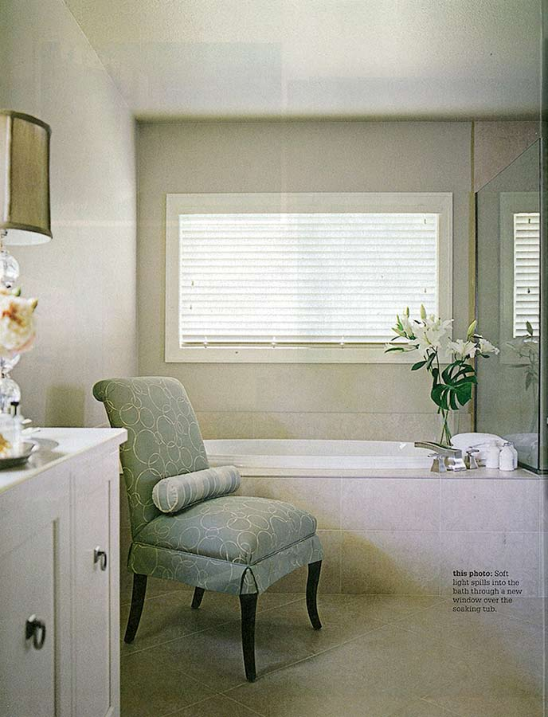
this photo: Soft light spills into the bath through a new window over the soaking tub.